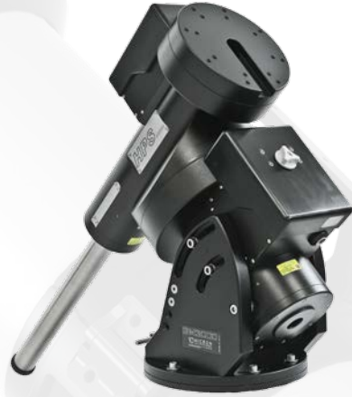
GM 3000 HPS 100kg (220 lbs) load capacity