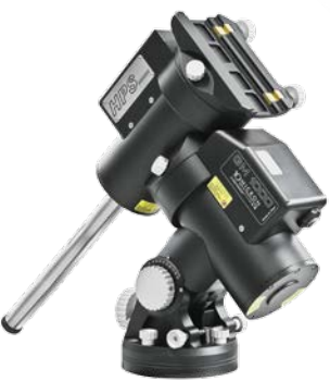
GM 1000 HPS 25kg (55 lbs) load capacity