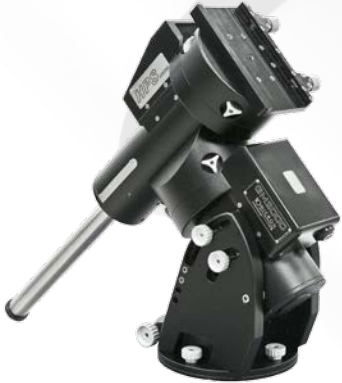
GM 2000 HPS II 50kg (110 lbs) load capacity