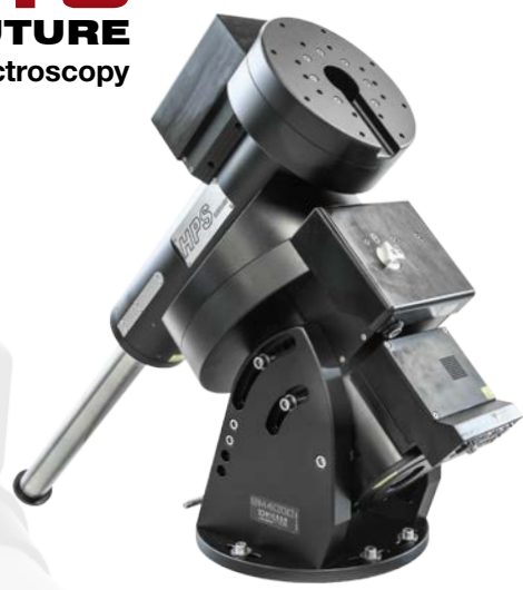
GM 4000 HPS II 150kg (330 lbs) load capacity