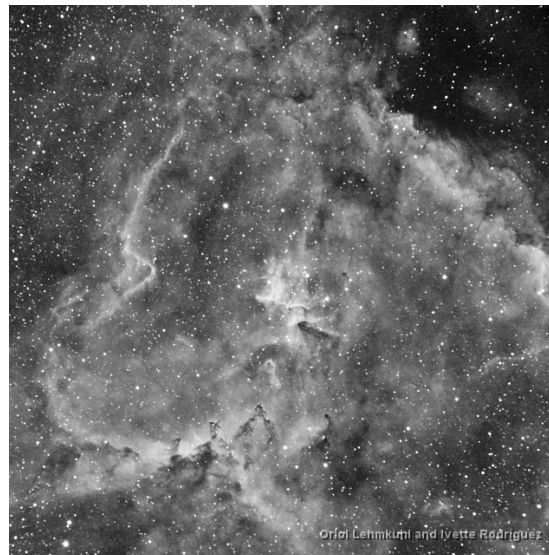
Figure 2: The Heart nebula in Cassiopeia in H\alpha .

The most common emission line in star forming regions is the Hydrogen alpha ( H\alpha ) at 653.6nm , corresponding at the red part of the visible spectrum. In narrowband astrophotography is the most used filter as it is very common in emission nebulae (see fig. 2).